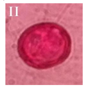
Figure 3. Ixora nigricans R.Br. ex Wight & Arn plant. Note: (I) Flower morphology; (II) Pollen on 400x magnification.