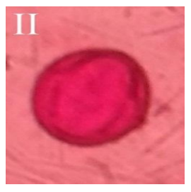
Figure 7. Cleome rutidosperma DC. plant. Note: (I) Flower morphology; (II) Pollen on 400x magnification.

The results of identification of flowering undergrowth found in the Bantarbolang Nature Reserve are members of 6 different families, namely Marantaceae, Rubiaceae, Acantaceae, Cucurbitaceae, Asteraceae and Capparidaceae. The most commonly undergrowth that found are weed plants that consist of Maranta arundinacea L., Asystasia gangetica (L.) T. Anderson, Cyanthillium cinereum (L.) H.Rob. and Cleome rutidosperma DC. There is 1 species which is an ornamental plant, Ixora nigricans R.Br. ex Wight & Arn and 1 plant species that can be consumed is Momordica charantia L.