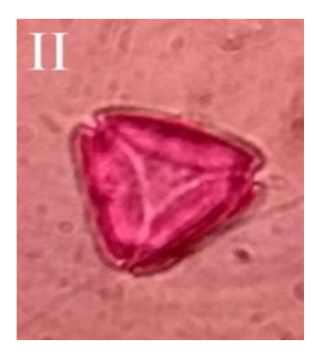
Figure 2. Maranta arundinacea L plant. Note: (I) Flower morphology; (II) Pollen on 400x magnification.

The second species is Ixora nigricans R.Br. ex Wight & Arn or commonly called soka is one of the Rubiaceae family members in the form of shrubs that normally live in the forest. This plant has a simple leaf type with a pointed leaf tip (acuminate), thin leaves, no hair and has black color when dry. The stem has a length of about 0.4 - 1.2 cm, white flowers arranged in terraced (cymosa) located at the top of the stem (Figure 3.I). This is in accordance with Bridson & Robbrecht (1985) that the genus Ixora has a pollen unit monad and a tricolporate apertura which means it has 3 colpus and 3 porus. Another research conducted by Zahrina et al. (2017) shows the pollen morphology of the genus Ixora has tricolporate aperture and reticulate ornamentation. Another member of the Rubiaceae, the genus Coffea, has a spheroidal shape, most of the tetracolporate apertures and also found a tricolpate with a semi-tectate exin ornamentation and a partial reticulate (Chinnappa & Warner, 1981). This proves that the morphological characters of the genus Ixora and Coffea have similarities in shape, while other characters have variations that can be used as identifying tool from the genus to species level.